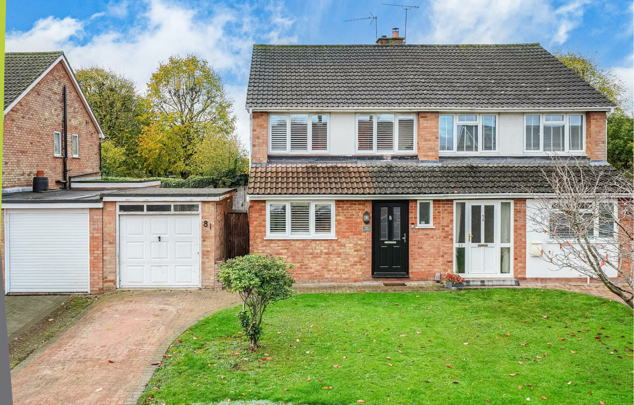
The Horseshoe, Leverstock Green, HP3 8QU Asking price £600,000